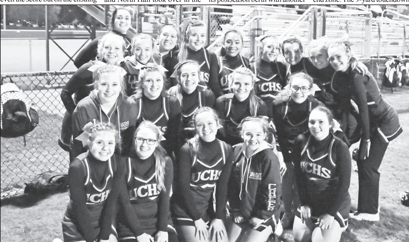
The Union County Cheer squad at North Hall.