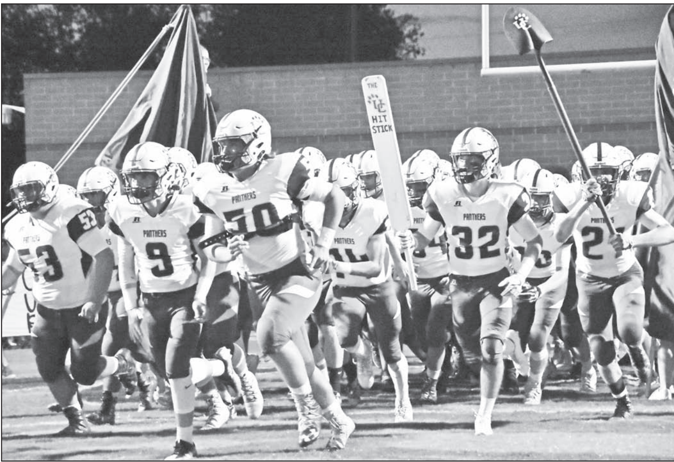
The Union County Panthers take the field at the North Hall Brickyard on Friday.

With a playoff spot on the line for both teams, the Panthers came out flat and fell behind 20-7 early in the second. Union would roar back with 13-unanswered to even the score but on the ensuing